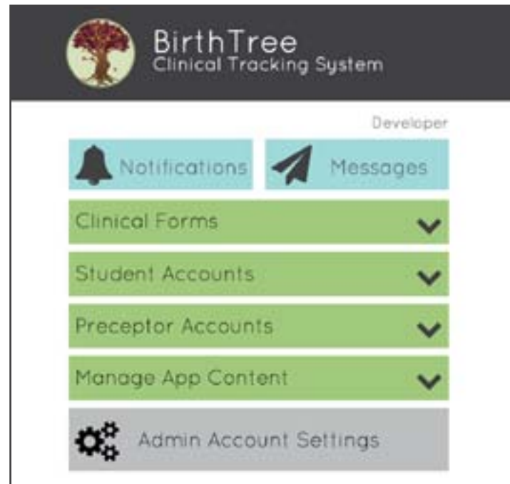
Admin Account Home Page