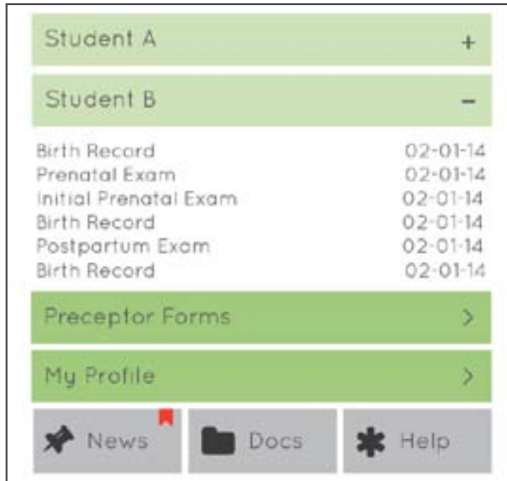
Preceptor Account Student Page