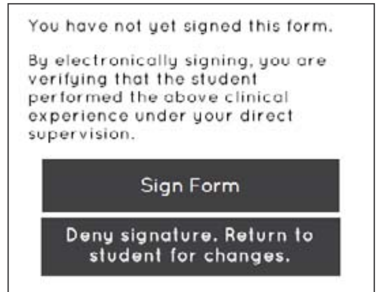
Preceptor Account Sign Form Page