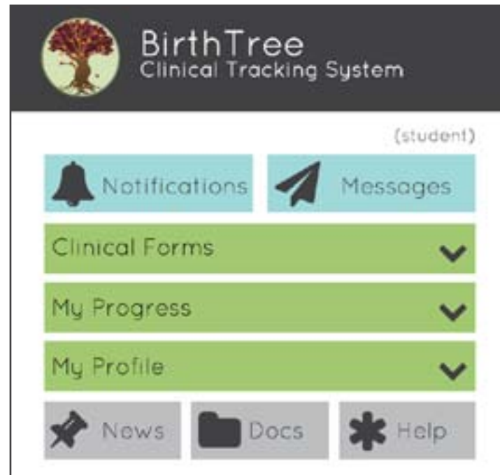
Student Account Home Page