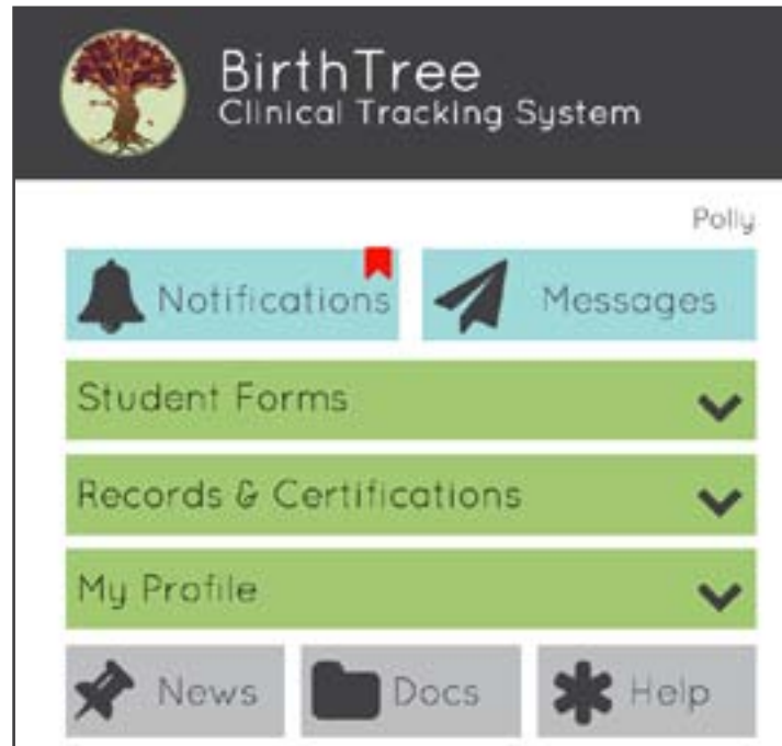
Preceptor Account Home Page